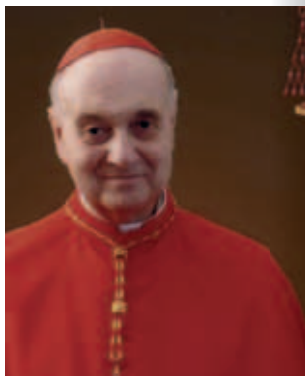
H. Em. Angelo Cardinal Comastri