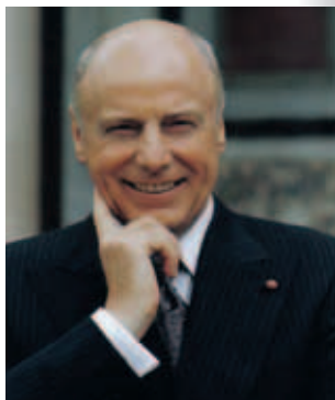
Sen. Dr. h.c. mult. Hans-Albert Courtial

In our world today, so dominated by the media, music is available always and everywhere, yet it has lost none of the illuminating power of its intellectual and emotional elements. The fact that music with its transcendental power – even more than words and pictures – can create a spiritual dimension for people is a timeless human experience. That is why religion and music have been closely connected since the beginning of time and religious rites without music are hard to imagine. Even when the music of the Liturgy has long since emerged from this environment and leads its own life in the concert halls of the world, it still maintains its transcendental quality. And the Fondazione Pro Musica e Arte Sacra has made contributing to the preservation of this patrimony of sacred music its aim. This is a twofold commitment, which on the one hand defends the vital and ever youthful power of sacred music from rigid traditionalism and on the other, avoids a modern trend that seeks to dissolve the sounds and forms of music, depriving it of the reason for its existence and of its spirituality.